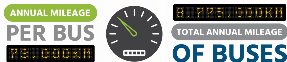
Figure 1: Main characteristics of the Eje 8 route